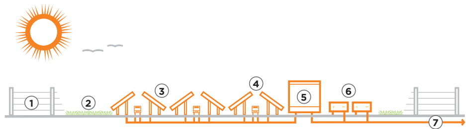
Figure 1: Components of a typical solar project

This image is indicative and for illustrative purposes only.